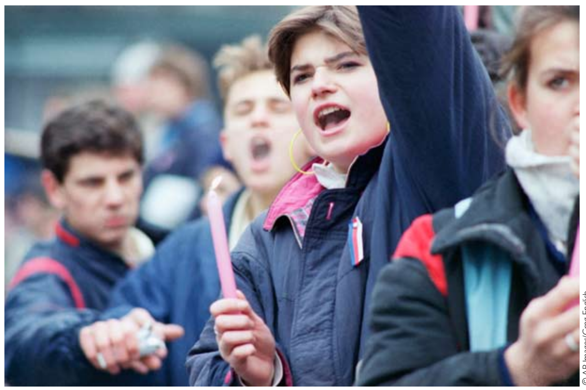
People power movements, such as this one in 1989 in Czechoslovakia, have helped bring down scores of authoritarian regimes.

Armed insurgencies impose great human costs. Nonviolent "people power" movements succeed by calling attention to official repression and winning support from the undecided.