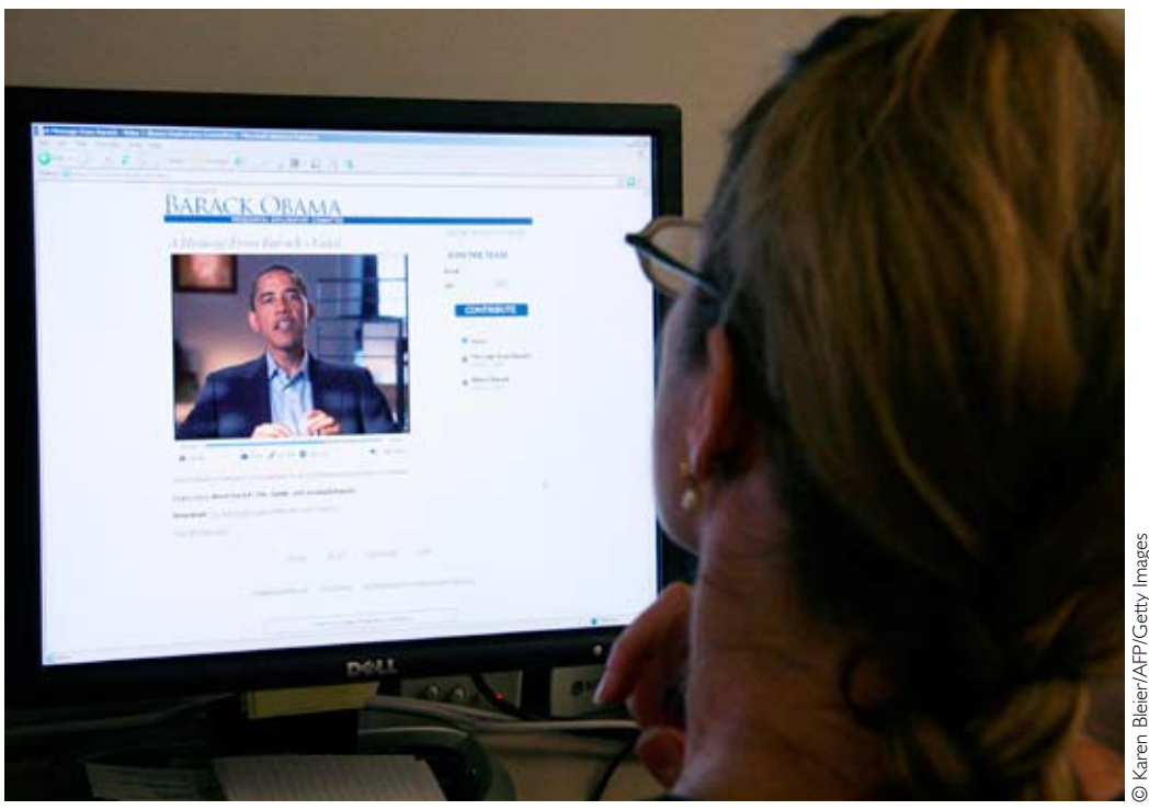
The Obama presidential campaign made extensive use of the Internet to connect with potential supporters.

The 2008 election victory of Barack Obama showed that Web-based tools for donating money and efficiently harnessing the efforts of large numbers of volunteers can be extraordinarily powerful.