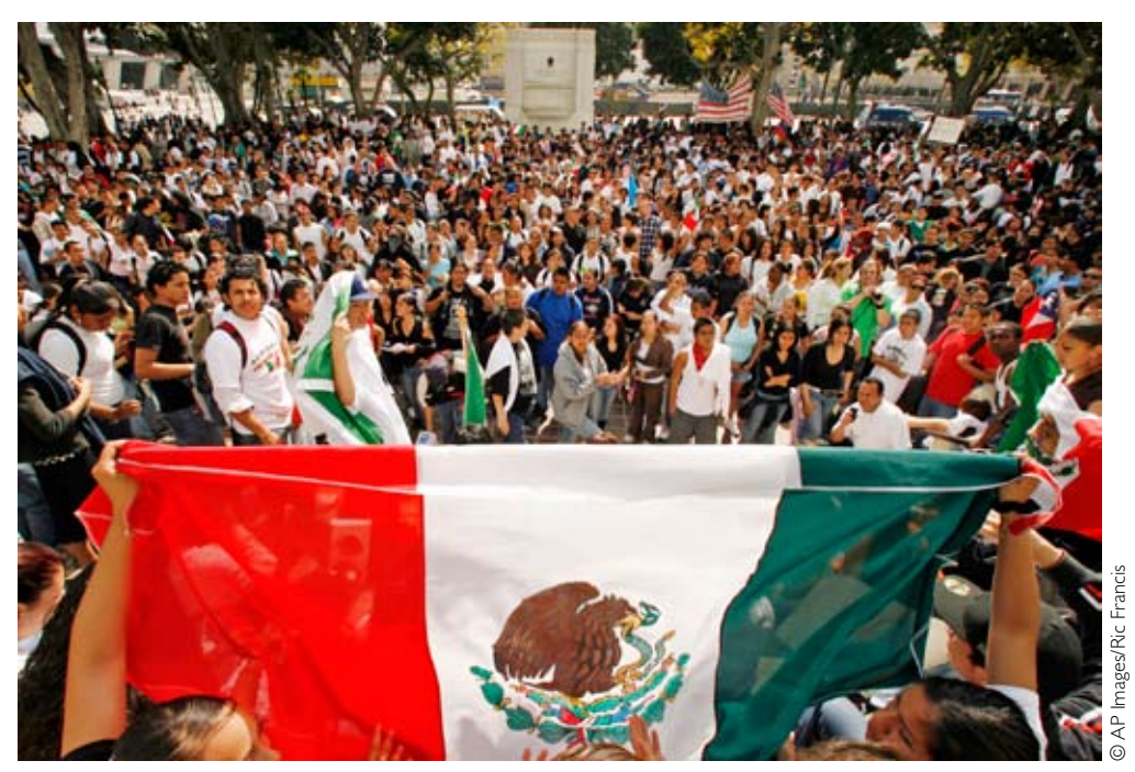
Using communication tools, Los Angeles students organized a surprise demonstration 30,000 strong.

Simple new telecommunications tools are removing obstacles to collective action by ordinary people, and thus changing the world.