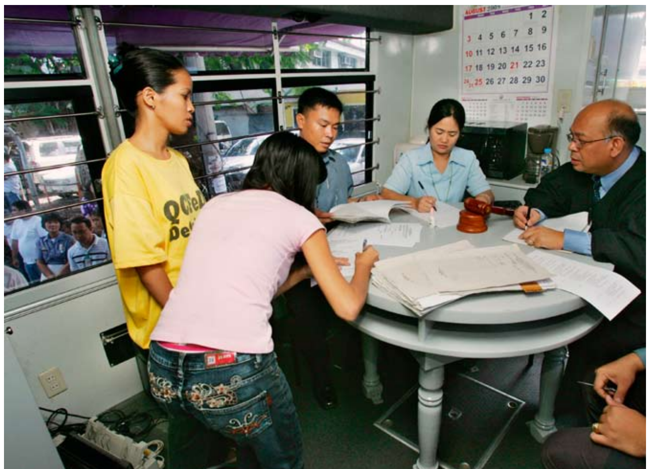
Legal institutions, such as this mobile court in the Philippines, have reduced the risk of violence.

in Africa have observed male chimpanzees from the same troop banding together to patrol their territory; if they encounter a chimp from a different troop, the raiders beat him, often to death.