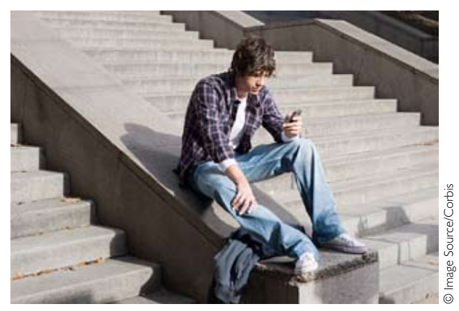
Improved communication capability can lead to more accomplishment.

Alaa: Waiting for prosecutors decision might actually spend the night in custody (01:57 p.m. April 04)