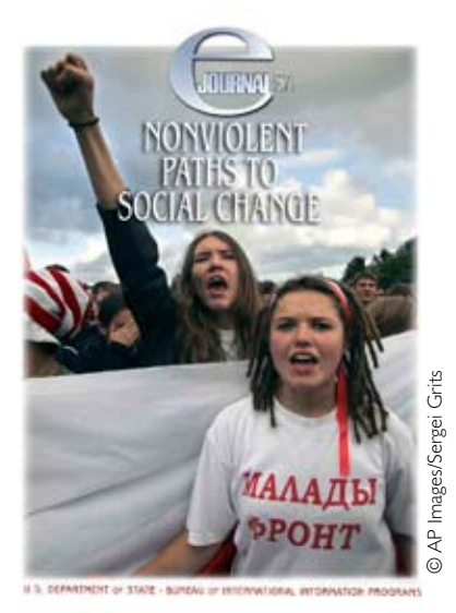
Cover Photo: On Belarus's 15th anniversary of independence in 2006, supporters hold a flag during a rock concert celebration in Minsk. The words on the T-shirt read: "Young Front."

The Bureau of International Information Programs of the U.S. Department of State publishes a monthly electronic journal under the eJournal USA logo. These journals examine major issues facing the United States and the international community, as well as U.S. society, values, thought, and institutions.