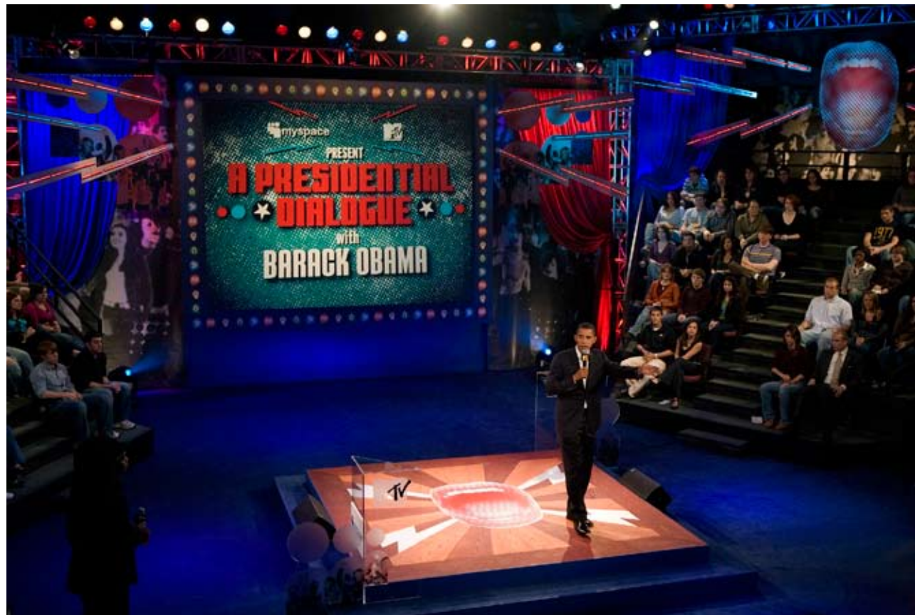
While engaging with a live audience in Iowa during the campaign, Obama also takes questions from online viewers.