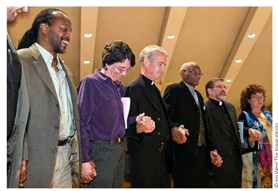
A rally for racial unity is held by a faith-based community organizing group in Warren, Michigan.

people." Since poor communities don't have money, organizers have to rely on people.