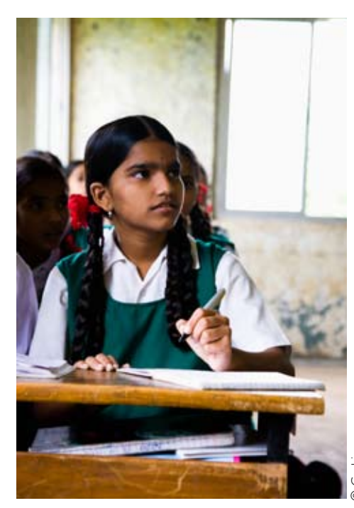
Educating girls is believed to lead to population stability and less social unrest.

Most conflicts now consist of guerilla wars, insurgencies, and terrorism — or what the political