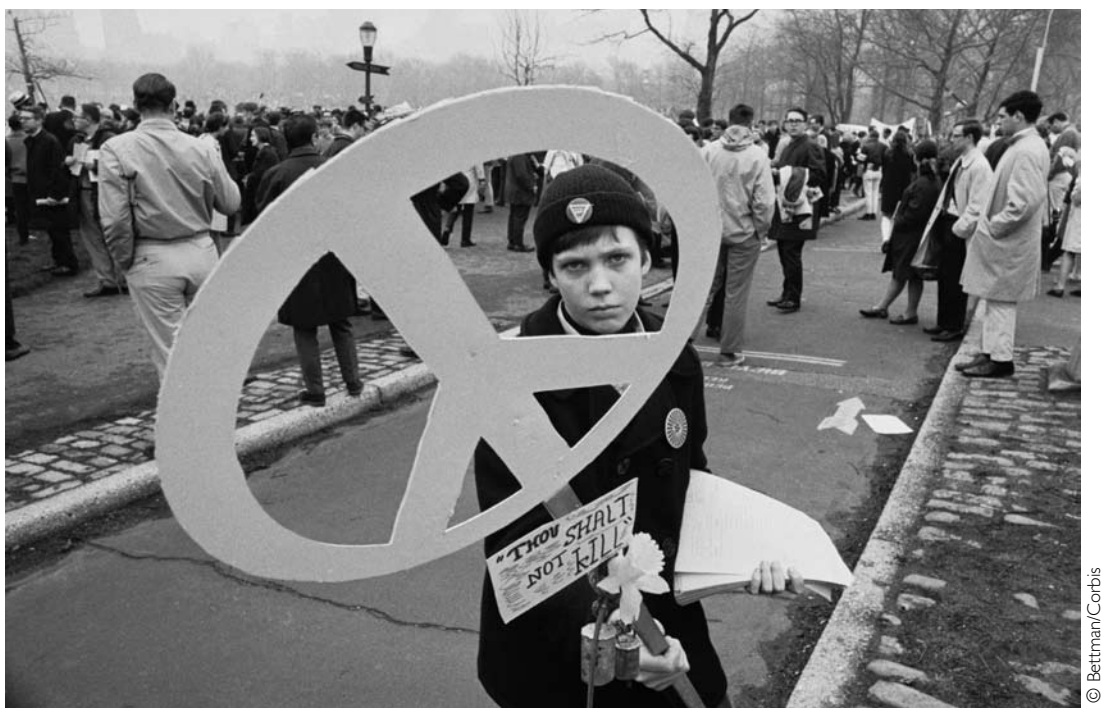
The nonviolent Vietnam War protests of the 1960s followed the example of the U.S. civil rights movement.

Rooted in 16th-century Europe, the intellectual traditions of nonviolent thought and action were developed in the United States in the 19th and 20th centuries and traveled abroad to Asia and Africa.