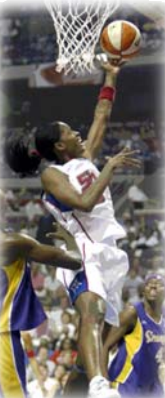
Swin Cash of the Women's National Basketball Association team, the Detroit Shock, shoots and scores.

business. The fields of play themselves simulate the wide-open spaces that eventually ran out of wide-open spaces, and so the fences came up. Now every baseball diamond, football field and basketball court is a version of the frontier, with spectators added,