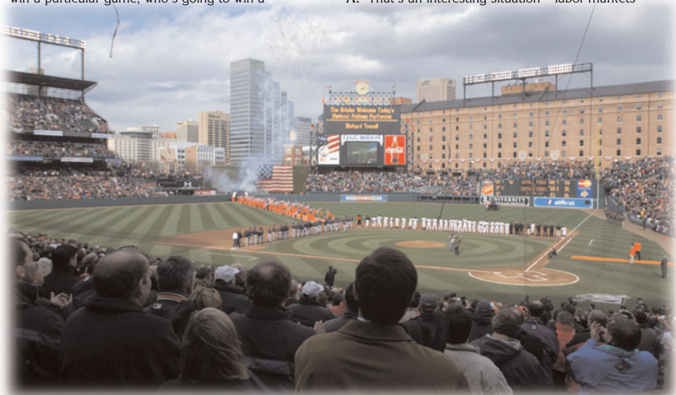
Baseball's return to the hearts of U.S.downtowns: Baltimore's Camden Yards.

A: That's an interesting situation – labor markets