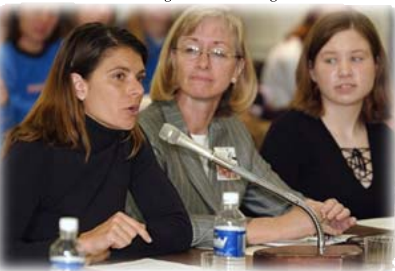
Mia Hamm (left), U.S. soccer star, testifies before Congress alongside a sports executive and a high school field hockey player. All underscore women's expanded role in sports in America.

law, partnerships arose between women athletes and the many institutions that drive sports in the United States among them the NCAA, the Olympics, and television. Once the world of amateur athletics for women opened up, so, too, did the doorway to corporate America, which led to more and more