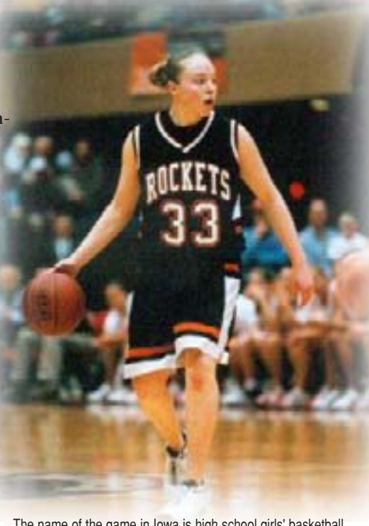
The name of the game in Iowa is high school girls' basketball.

"Maybe it shouldn't be this way, but it is - when you're winning, the success seems to run all through these hallways," he said. "There's more excitement for everything. There's more pride. Everybody seems to work harder."